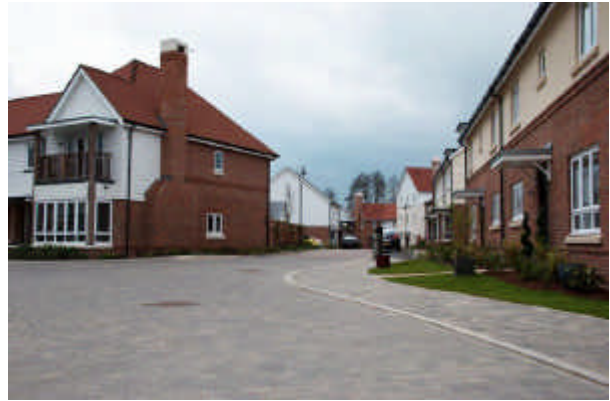
New housing development unsympathetic to the local environment

If you have an interest in this topic you can find our more, follow all the latest news and articles and even watch videos explaining how the countryside is under threat at this website www.faceit-group.org . The group also has a presence on Facebook – why not ask to join, and join in the debate?