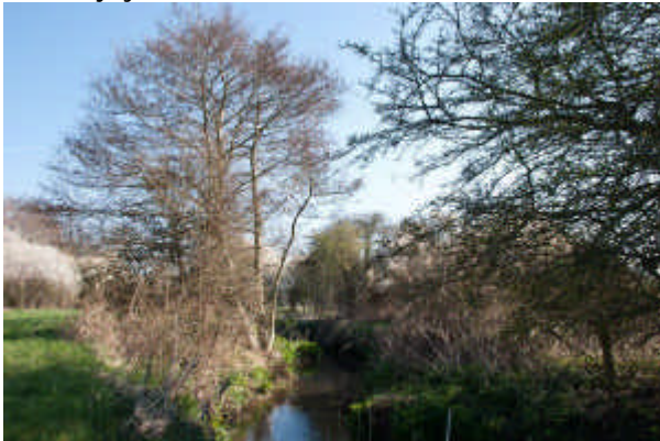
The beautiful and easily accesible countryside around Fleet